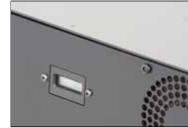
The cycle counter