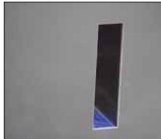
The erase area