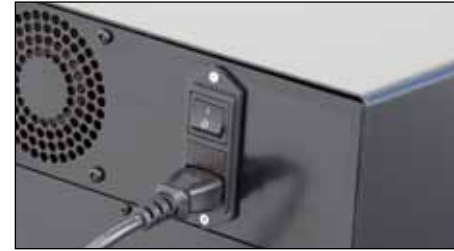
The main power connector

At the backside of the degausser you will find the main power connector as well as the Cycle counter display. The Cycle counter display displays the number of cycles the degausser has performed in total. The display cannot be reset.